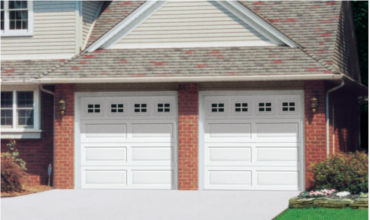
Model 9100 shown in Ranch design with Stockton I window inserts